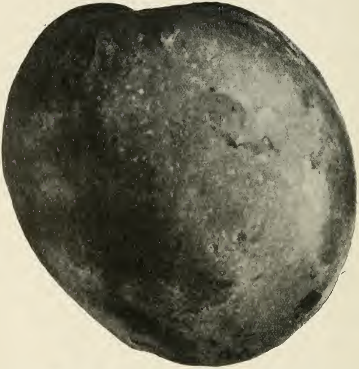
A FRUIT OF MANGO CHINO WEIGHING 16 OZ. FROM THE QUINTA AVILES, CIENFUEGOS. ONE OF THE LARGEST CUBAN TYPES.